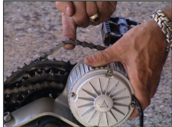
The eLation bike system attaches to an extra gear set on a bike's chain wheels. Here the chain linking the motor (the big silver cylinder) to the extra gear is shown.

The rider can also take a rest when the motor is working because the freewheel clutch allows the extra gear to spin without moving the pedals.